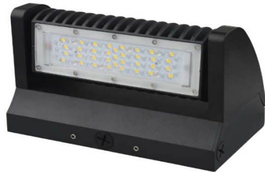
REVOLVE 25W to 60W-1