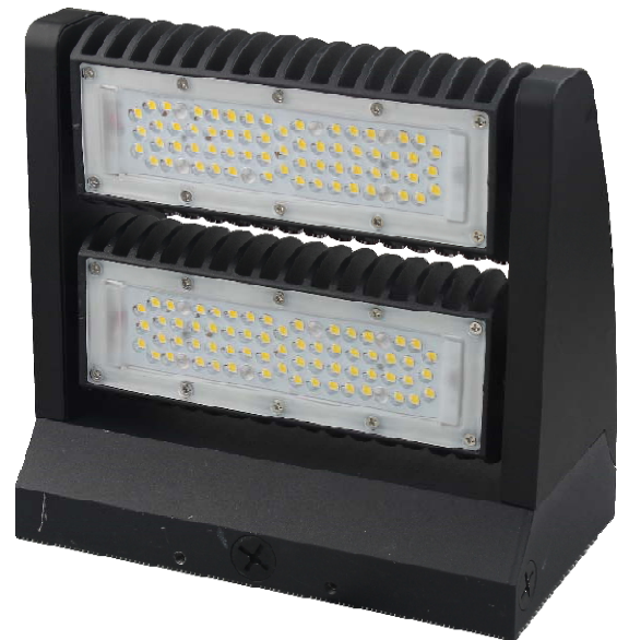
REVOLVE 60W-2 to 120W