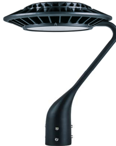
1A : 1-Arm Side Mount CAPRICORN-2 SM models only