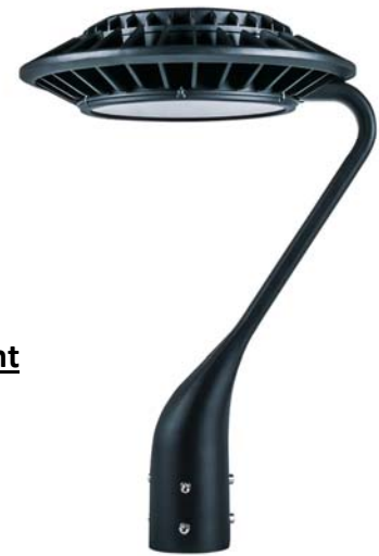
1-Arm Side Mount (Small Sizes Only)