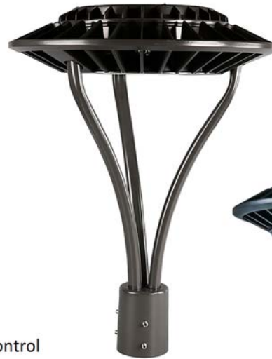
3-Arm Center Mount