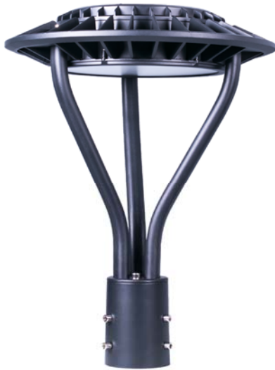
3A : 3-Arm Center Mount