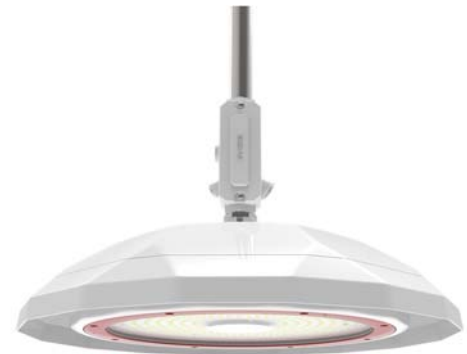
Pendant Mount with Junction Box