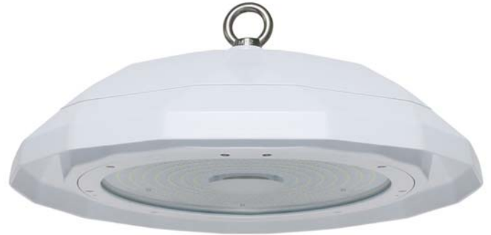
Hanging Ring Mount

The SHELL Series is an exceptional high bay that has a modern aesthetic and unique appearance - a favorite among architects and for design-focused applications. The SHELL fixture provides a strong lumen output of 150 lm/W and is available in an even higher lumen option (190 lm/W). The luminaire provides safety measures such as stainless steel screws and polycarbonate lens, and comes standard with motion sensor and 0-10V dimming. NSF rated.